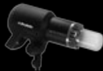
Profoto Tungsten Air 500 W and 1000 W