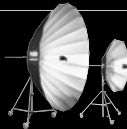
The line of Profoto Giant Reflectors consists of the the parabolic Giant Reflectors Giant Reflector 180 (180cm) 10 03 18 Giant reflector 240 (240cm) 10 03 19 Giant reflector 300 (300cm) 10 03 20 plus the Giant Silver 150 cm – 10 03 16, and Giant Silver 210 cm – 10 03 17. Optional front diffusers are available for all Giants.