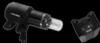
Profoto Daylight Air 400 W and 800 W